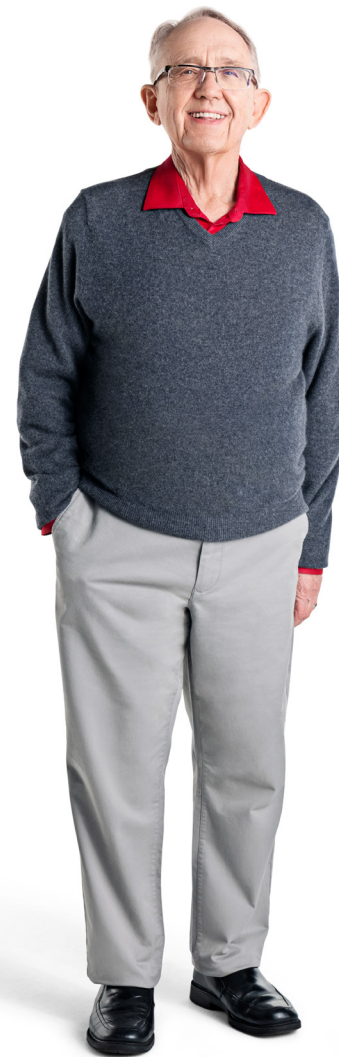
Not an actual patient.

Please see the next page for more details on these drug classes.